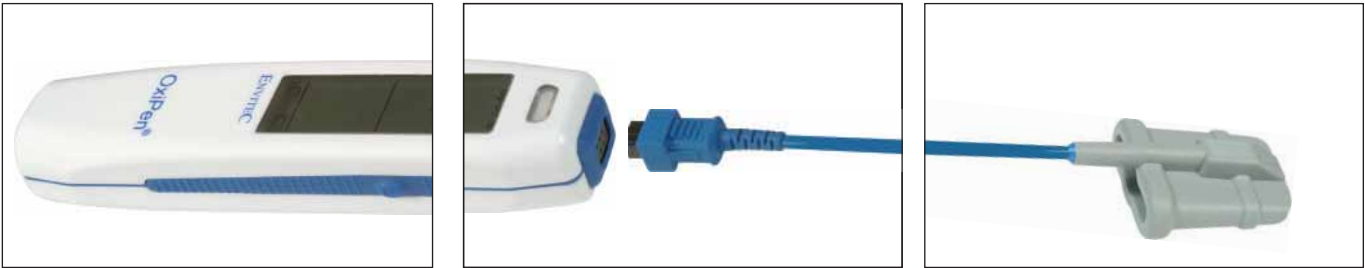
OxiPen®, relating connection and SoftTip® large

dicates relative perfusion at the measurement site. Thus the integrated Artifact Leveling System –“AL”, Oxi-Pen® secures the optimal measurement results without compromising accuracy, dynamics and artifact reliability in applications. Patient to patient monitoring Versatility in application The pulse oximeter OxiPen® offers you proven performance and ultimate versatility in application in EMS, hospital or clinical environments as well as in home use. From pre and post operative monitoring, pulmonology, movement therapy, home care and transportation and everywhere in -between- the OxiPen® with its simple functionality with its small and ergonomic styling makes it a reliable partner for you. The small and lightweight design makes it possible to carry OxiPen® anywhere in your pocket. Scalable & flexible – SpO 2 sensor solutions