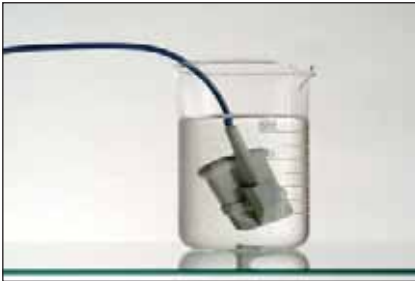
Easy cleaning and disinfection

n secure comfortable support for the operating regardless of application needs. OxiPen® provides beside sensor connection and low-battery indicator also automatic deactivating function after 3 minutes when not in use. It allows to provide 30 hours of continuous operation or approximately 3000 Spot checks at standard duration. The proven performance combined with simple operation makes OxiPen® your reliable guide in "patient to patient" SpO 2 monitoring.